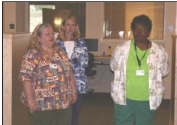
Staff attended an open house held on Thursday, August 26. CCU staff were on hand to give tours of the facility.

The unit also features 10 decentralized nursing stations,