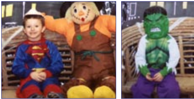
Pictured above are Trick or Treaters from last year's event.