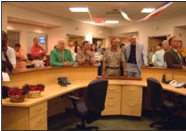
A large crowd attended the CCU ribbon cutting on Aug. 27.